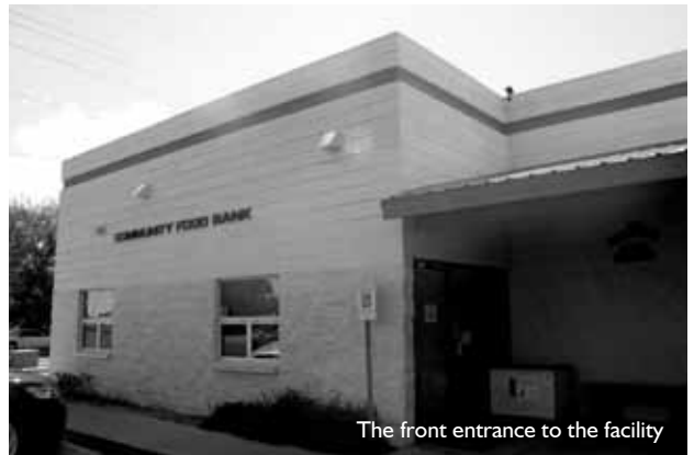
The front entrance to the facility

The original Green Valley facility was 4,000 square feet including a 3,000 square-foot warehouse. Over 1.2 million pounds of food each year are collected, stored, and distributed in this small facility. Food bank staff and key volunteers are constantly reevaluating existing space in an effort to improve efficiency. With a client load that has tripled in the last four years, the need to store more food and have the ability to quickly move it to the client distribution room was essential.